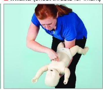
TIP: For infants, support the head and neck securely. Keep the head lower than the chest.